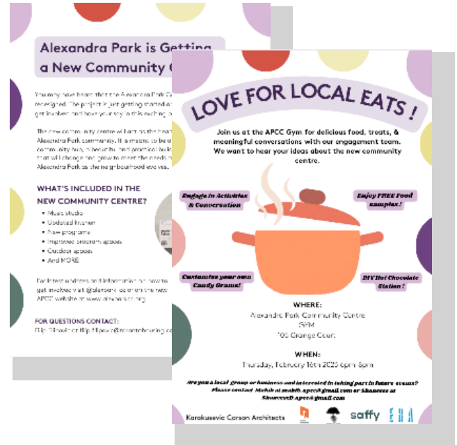
Figure 1: Over 700+ flyers were distributed to residents.

On February 16, 2023, the project engagement team held a community Pop-Up event titled “Love for Local Eats” . The feedback and recommendations collected from the attendees of the event will be utilized to inform and shape the spatial brief of the new APCC.