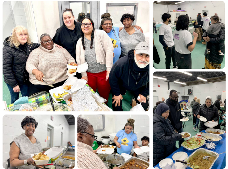
Figure 4: Photos of local vendors and event attendees with AP-Staff, project team members.